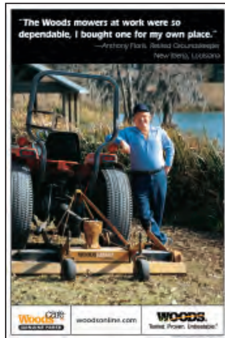
WOODS FINISH MOWER POSTER #60216 $3.50