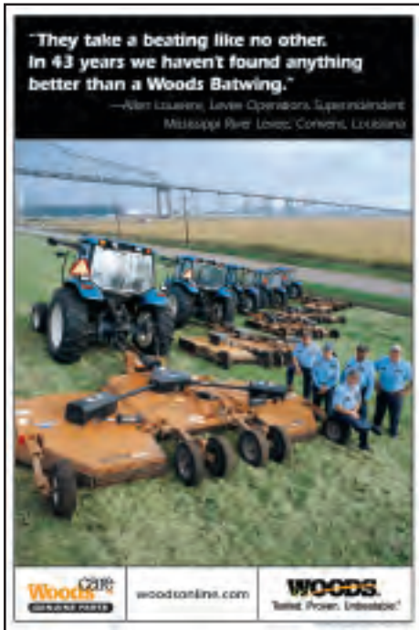
BATWING® POSTER #60215 $3.50