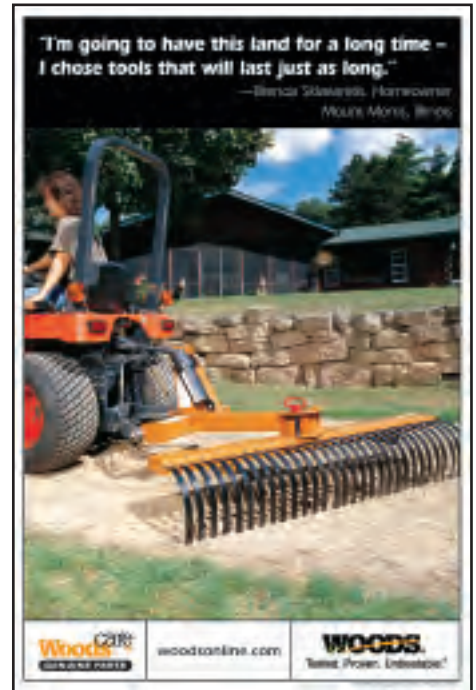
ESTATE SERIES™ POSTER #60213 $3.50