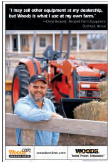
WOODS LOADER POSTER #60218 $3.50