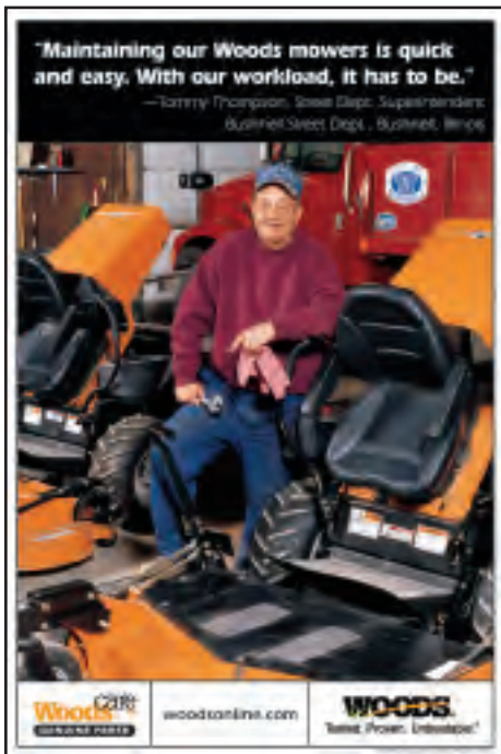
MOW'N MACHINE™ POSTER #60217 $3.50